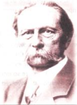
Karl Benz, the inventor of the modern automobile

The First Automobile helped to fulfill Daniel's prophecy to make possible these words, "...many shall run to and fro..." Daniel 12:4